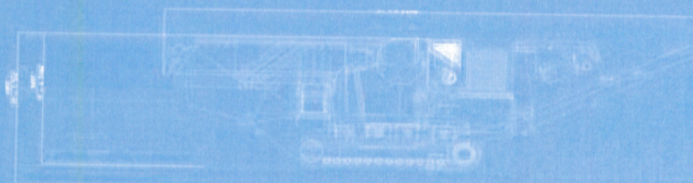
Side view MC 110 Z transport position