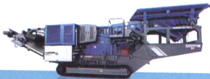
Side view MC 110 R transport position