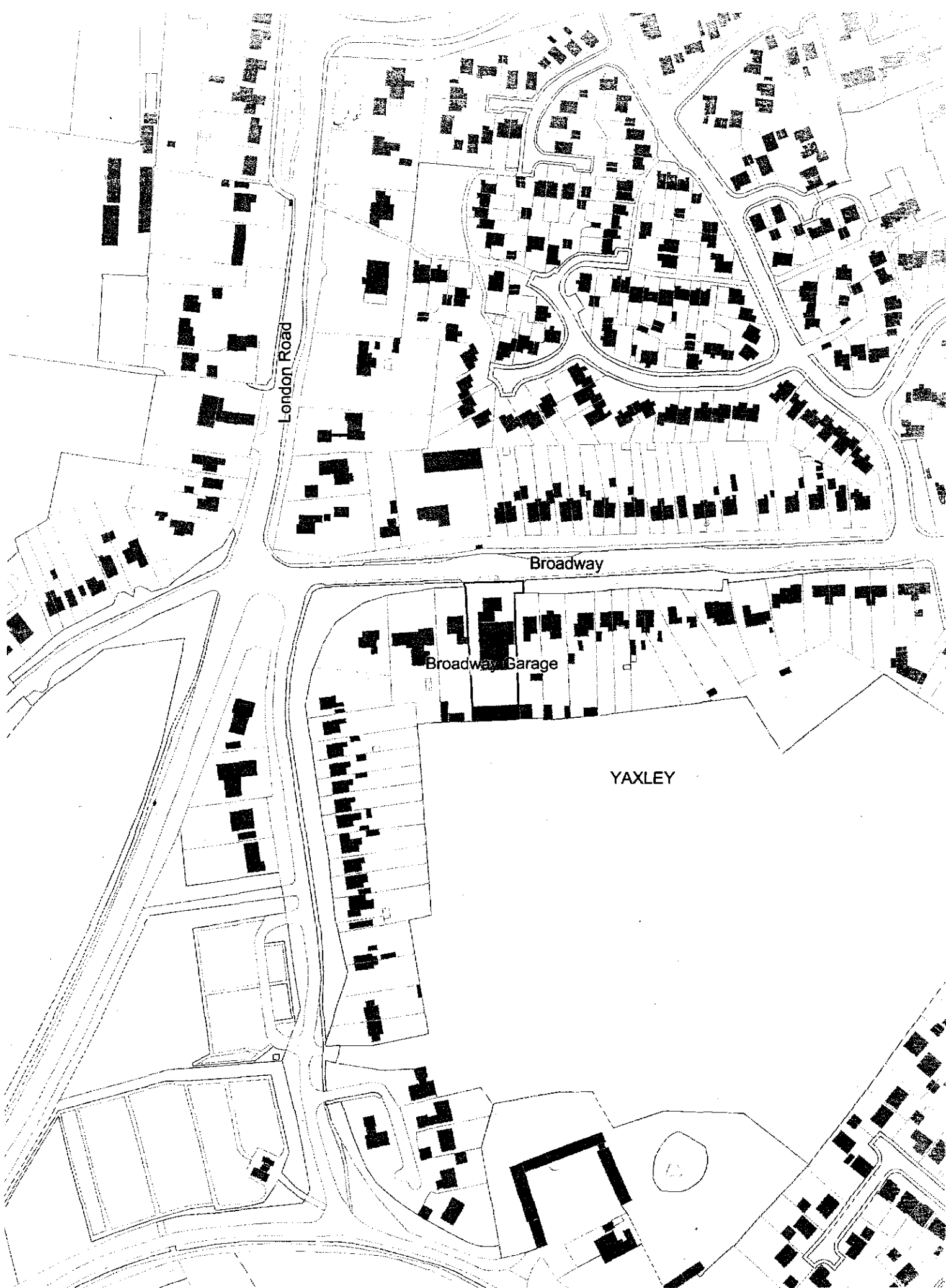
Drawing Reference PET 1/02/A Location Plan